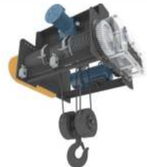
ELECTRIC WIRE ROPE HOIST