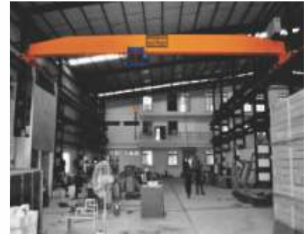
SINGLE GIRDER E.O.T CRANES