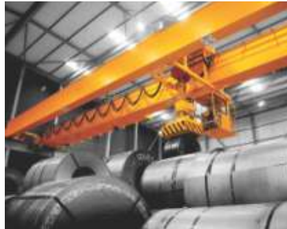
COIL HANDLING CRANES