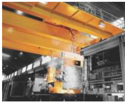
STEEL PLANT CRANES