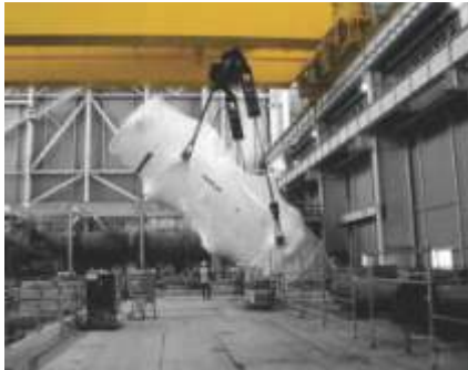
POWER PLANT CRANES